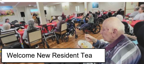
Welcome New Resident Tea