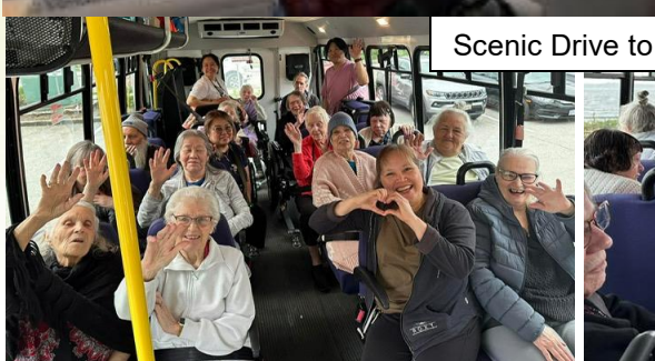
Scenic Drive to White Rock