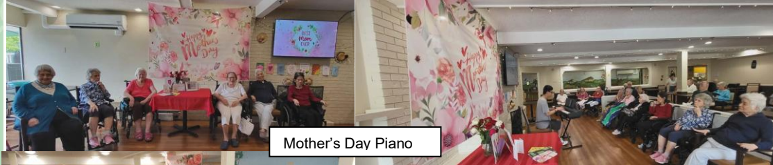
Mother's Day Piano