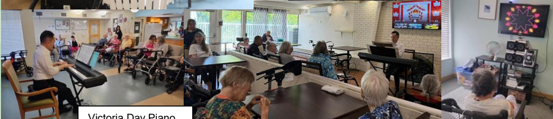
Victoria Day Piano