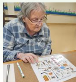
Junk Drawer Detective