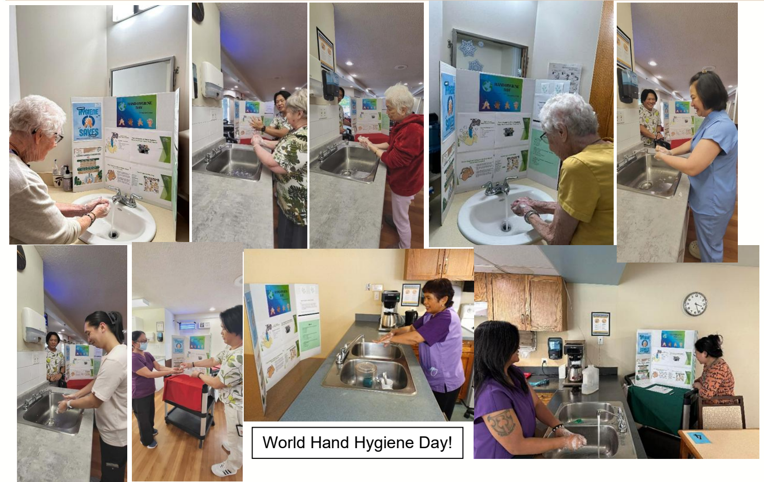
World Hand Hygiene Day!