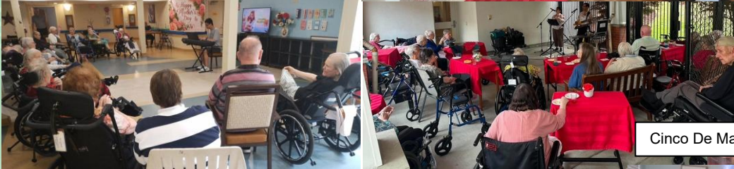
Cinco De Mayo