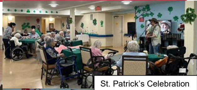
St. Patrick's Celebration