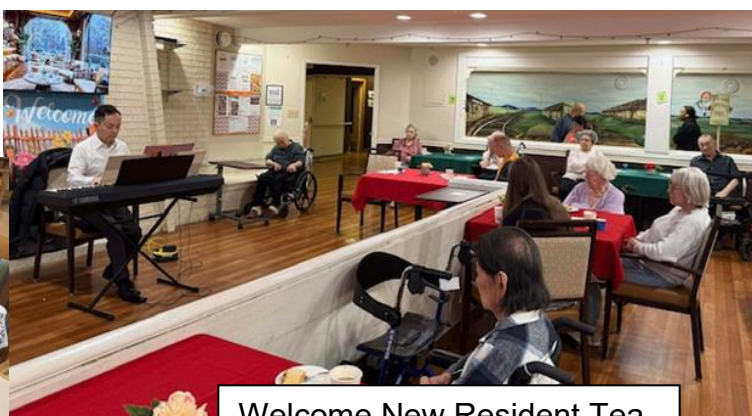
Welcome New Resident Tea