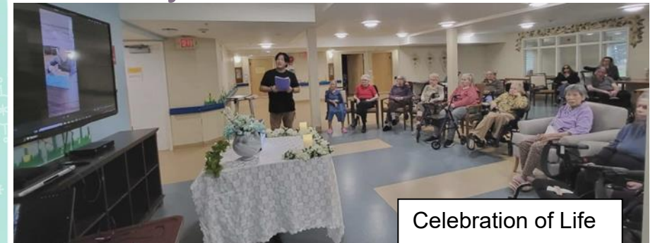
Celebration of Life